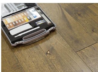
CHIPS, DEEP DENTS